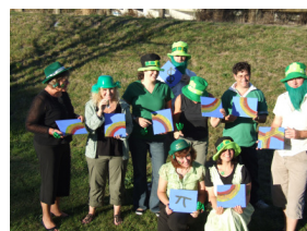
And it all happened on St Patrick's Day! Its not the final art work that is important but the lessons learned by the team in creating it!