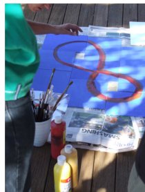
A symbol was developed to reflect the team's vision