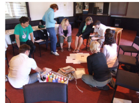
The mural planning phase