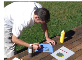
There is an 'I' in all teams! Its how you bring them together that counts!