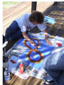
Each member selected their colour from a graduated range.