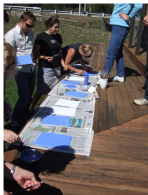
A background colour was agreed