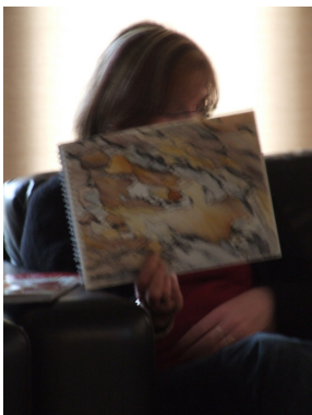
NOLA'S SHOW AND TELL