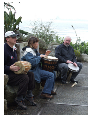
THE RHYTHM SECTION

"From a percussion point of view... The exploration has begun! Coffee tins, bits of pipe, broom sticks, cooking utensils, 1/2 a glass of water etc have all become percussion instruments... Everyday items go from mundane to exciting when you ask yourself "I wonder what that sounds like if I give it a bash?"