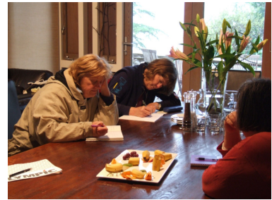
AND MORE WRITERS