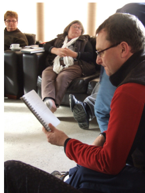
THE COLLABORATIVE POETRY READING

In the random beauty of the beach I discovered that even seeming chaos has elements of structure that I found engaging. I had FUN but also time for reflection and time to be creative and time to be still. One word that sums up my experience would be, 'energising'.