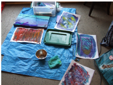
EXPRESSIONS IN PAINT