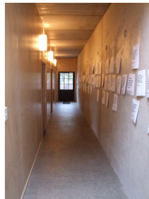
THE CREATIVITY POSTER WALK

"For me, this is what I've taken from the retreat - lovely friendships., inspiration, joy, freedom, energy, a new way of looking at life, a fresh sense of fun and mischief."