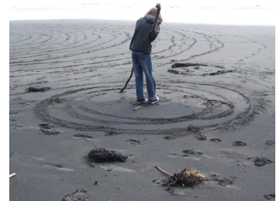
STU DESIGNING A LABYRINTH