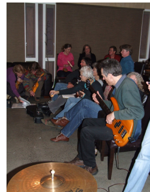
THE MUSIC EVENING WITH GUESTS