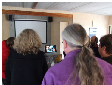
GATHERED AROUND THE LAP TOP

"Had a walk on the beach yesterday where I would usually avoid the stretch of pebbles. I walked straight over them and enjoyed the "music" they made, making up songs as I went. I walked on the road with the dog , where the clonking started a rhythm unable to resist my hands joining in."