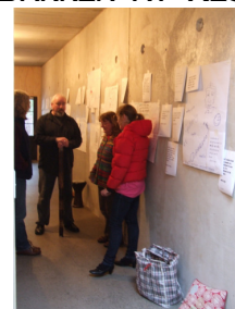
VOICES IN THE HALLWAY

"Thank you so much for the incredible weekend – I really enjoyed it."