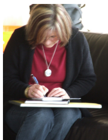
NOLA AT WORK

"Your facilitation; It was 'just right' for me. I enjoyed the quotes, background theory, your insight and personal passion that set the scene and kept pulling us back to the purpose through out the weekend. I enjoyed the varied activities that made you think – e.g. draw using only 7 lines... and found the 'visualization' exercises you talked us through very useful for me. I liked the balance with freedom to choose and no requirements to perform or share if you didn't want to (we're perverse beings. – when you don't have to you usually do!)"